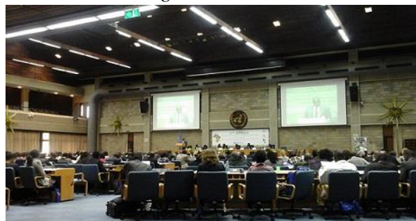
High level opening session at the ebafosec conference

Ecosystems approaches , an alternative to conventional approaches, aims at maintaining and improving the fertility and productivity of ecosystems. These approaches often include conservation agriculture practices such as crop rotation and inter-cropping; and biological control of pests. Such approaches are implemented to prevent soil erosion, improve soil fertility and enhance biological diversity. And with this, is an enhancement of productivity of ecosystems and consequent improvement in potential yields.