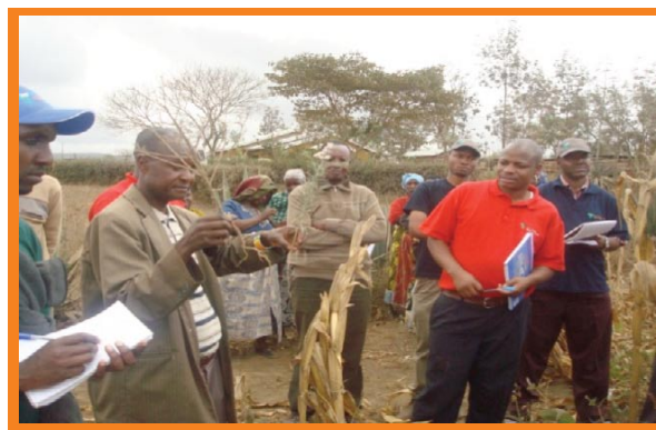
Above: A farmer shows the International Conservation Agriculture Training participants the effect of hard pans on the growth of plants.

Carbon markets are still tiny and depend on domestic policies in Africa, however they have the potential for up-scaling to leverage meaningful private sector investments; it was noted during Agricultural Carbon Project Development Workshop in Kisumu, Kenya. The ACT East and Horn of Africa Sub-Region Coordinator, Dr. Simon Lugandu participated in the workshop whose purpose was to build hands-on capacity on how to develop smallholder agricultural carbon finance projects that can inform respective sector initiatives. The topics covered during the workshop included: Core concepts of climate-smart agriculture; Agricultural mitigation options and related carbon measurement approaches, Carbon project development cycle, Carbon accounting methodologies for Sustainable Agricultural Land Management and step-by-step introduction to developing a carbon project.